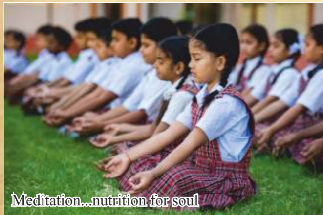
Meditation...nutrition for soul