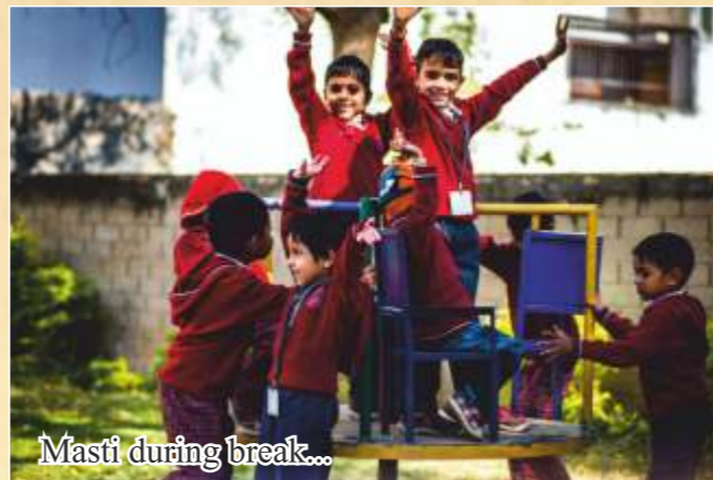
Masti during break...