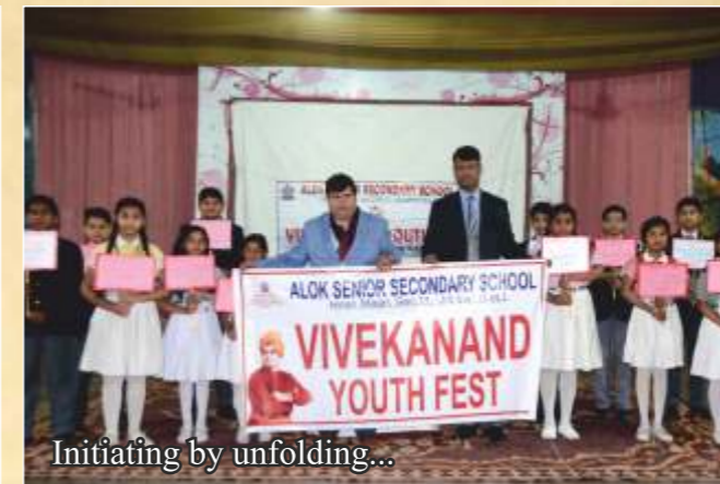
Initiating by unfolding...