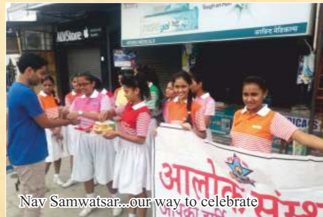
Nav Samwatsar...our way to celebrate