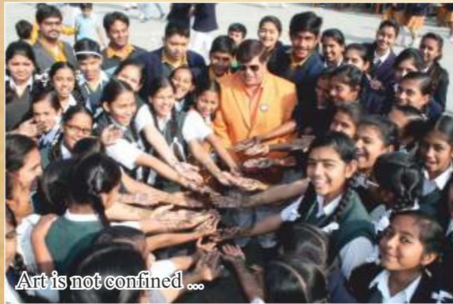
Art is not confined ...