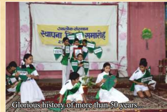
Glorious history of more than 50 years...