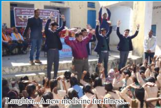
Laughter...A new medicine for fitness...