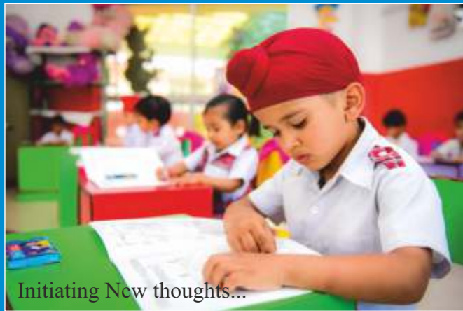
Initiating New thoughts...