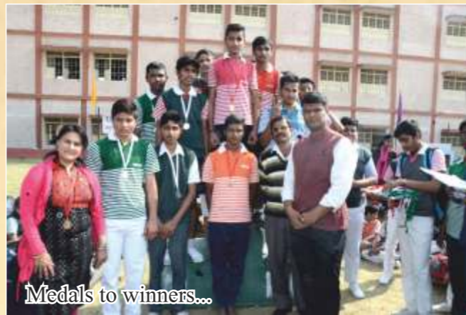
Medals to winners...