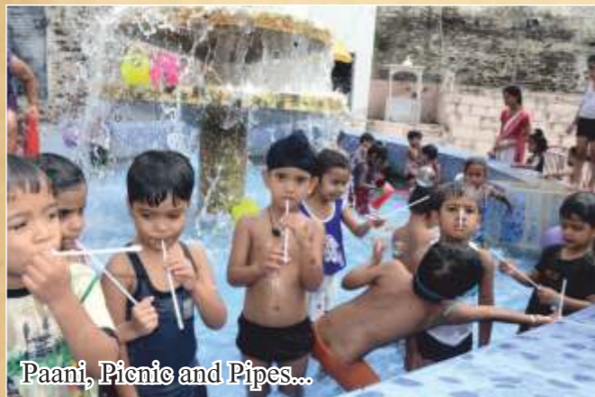
Paani, Picnic and Pipes...