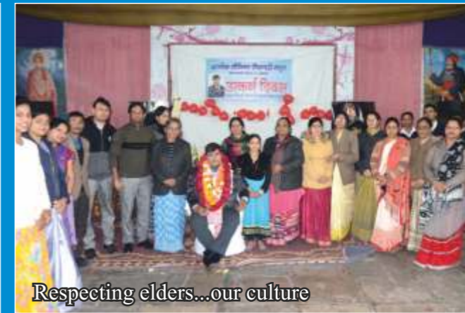
Respecting elders...our culture