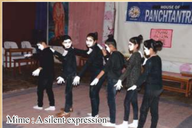
Mime : A silent expression