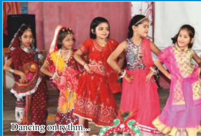
Dancing on rythm...