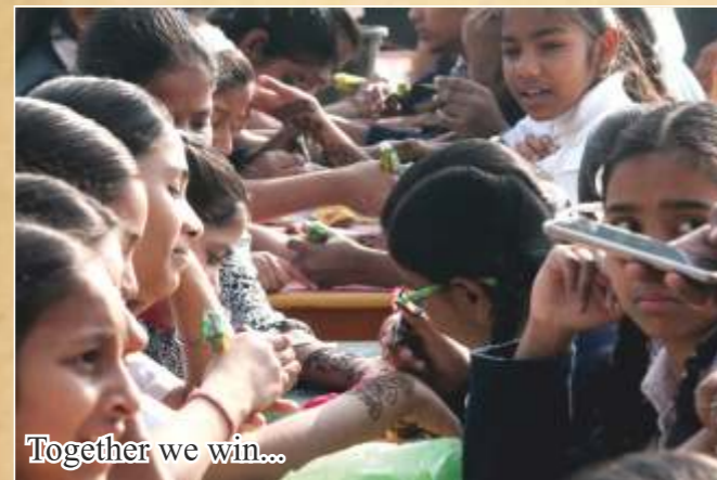
Together we win...