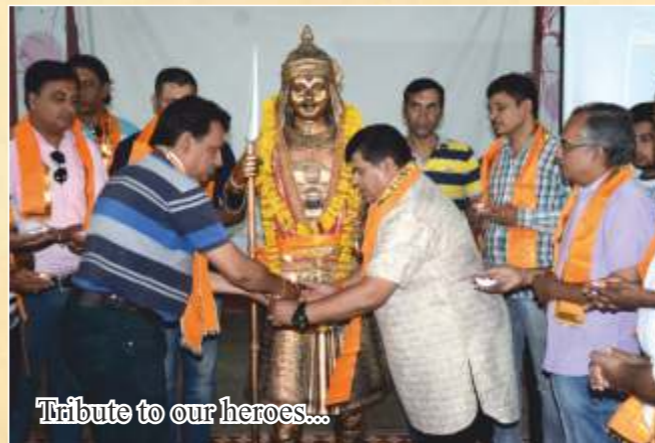
Tribute to our heroes...