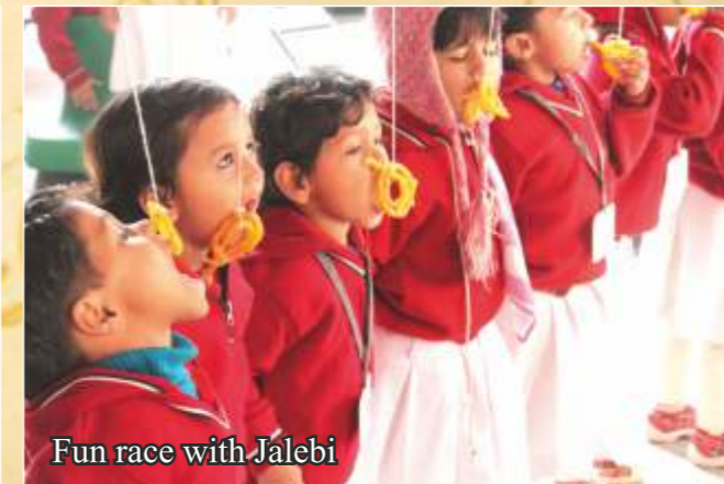
Fun race with Jalebi