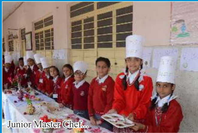
Junior Master Chef...