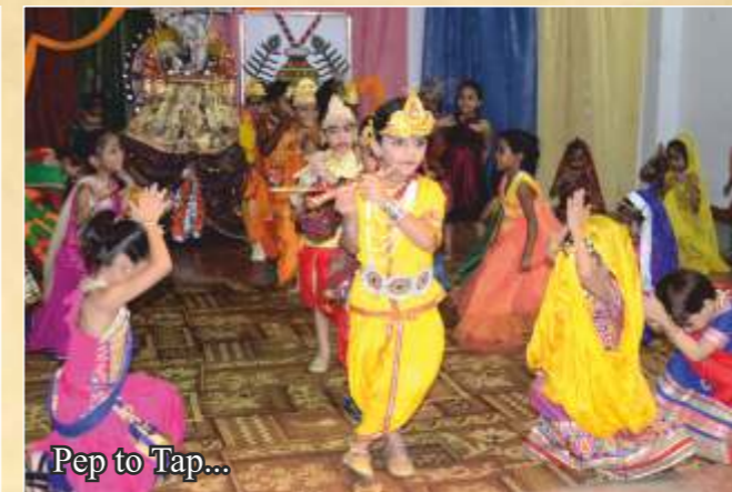
Pep to Tap...