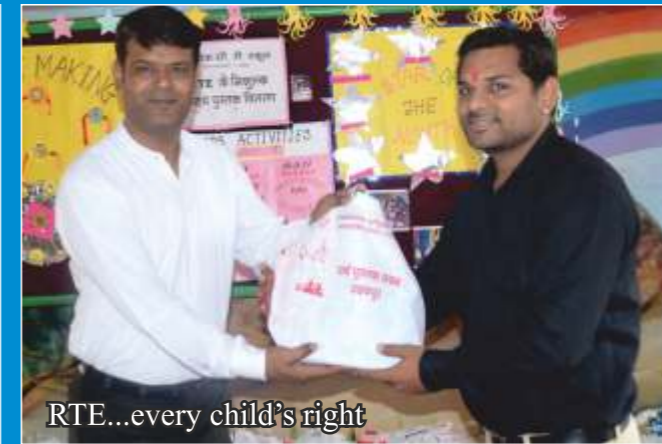
RTE...every child's right