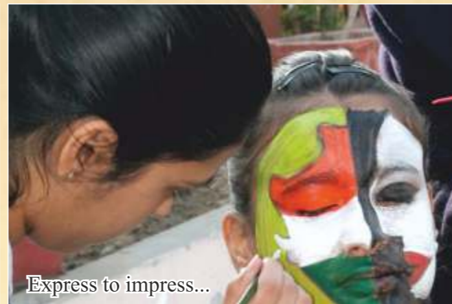
Express to impress...