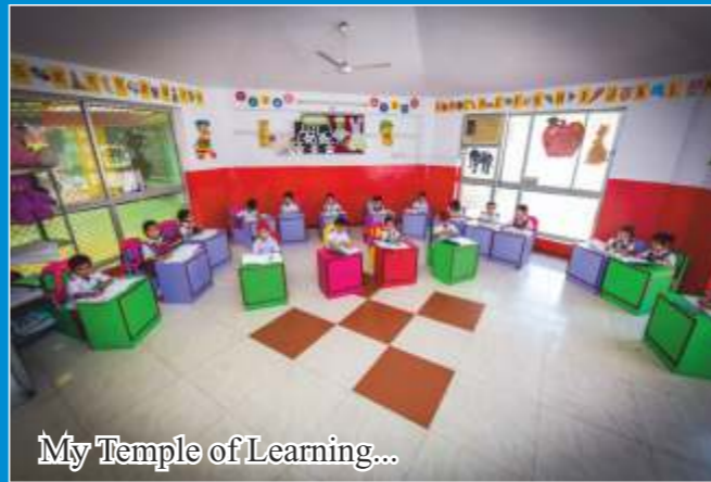
My Temple of Learning...