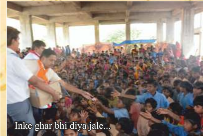
Inke ghar bhi diya jale...