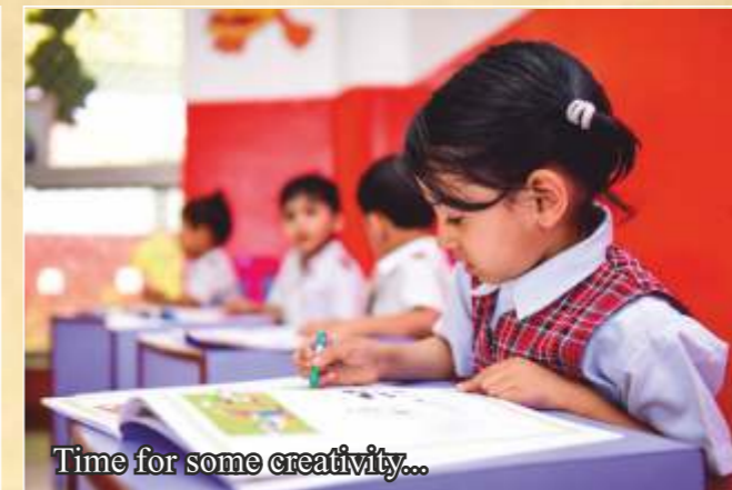
Time for some creativity...