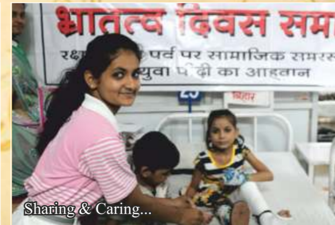
Sharing & Caring...