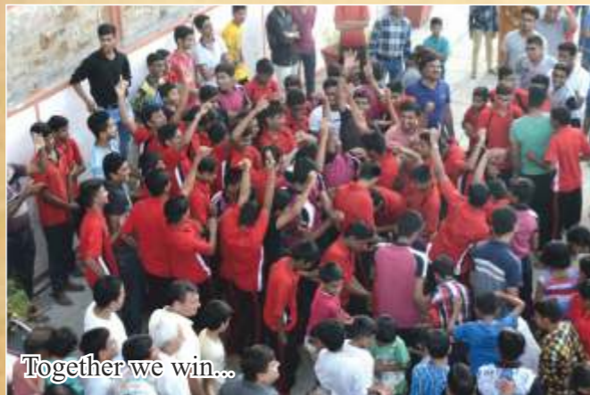
Together we win...