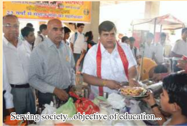
Serving society...objective of education...