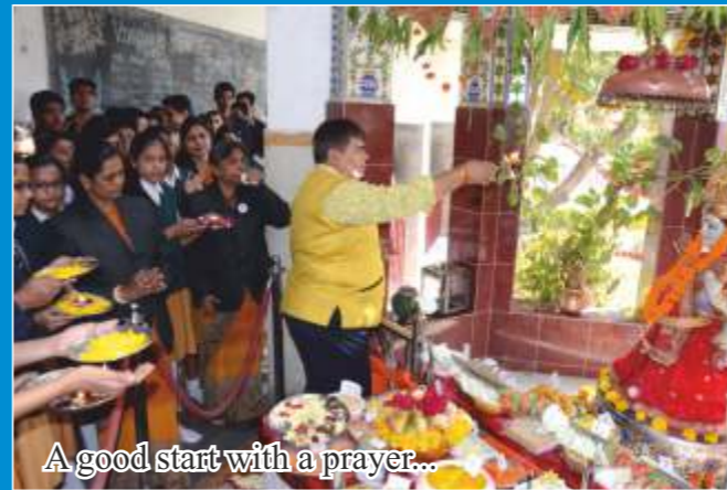
A good start with a prayer...