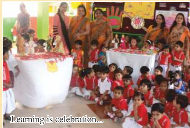
Learning is celebration...