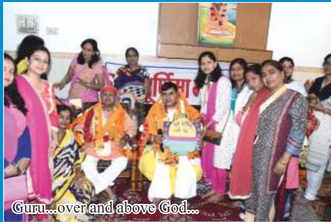
Guru...over and above God...