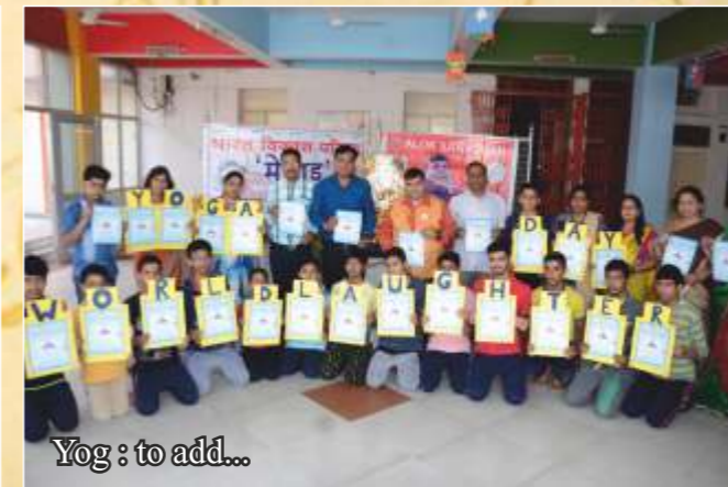
Yog : to add...